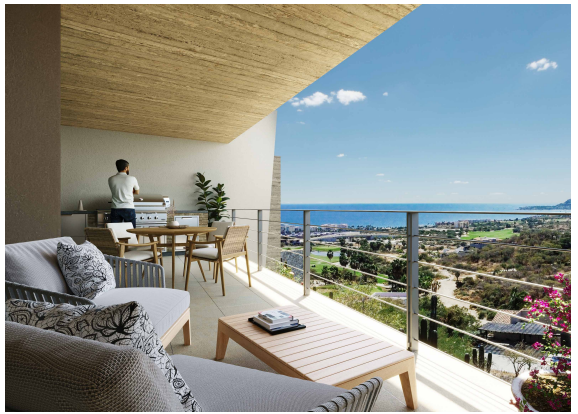
3 BEDROOMS | 3 BATHROOMS MLS: 22-3962

Unobstructed ocean views overlook the Nicklausdesigned 18-hole golf course and Palmilla Point from floor-to-ceiling double-glazed windows that open onto a large terrace. Beautifully appointed with white oak custom carpentry and Italian porcelain floors, this residence exudes effortless sophistication. The open-concept living and dining areas open onto a 436-square-foot terrace for optimal entertaining. A fully equipped Italian kitchen is complete with luxury appliances and soft-close hinges. The flexible studio can be a bedroom, home office, media room, or service room. In front, you will find an additional ensuite bedroom tucked away at the back of the residence for extra privacy. The primary bedroom features an ensuite bathroom with double vanities, a large walk-in closet, and direct access to the terrace with magnificent views.