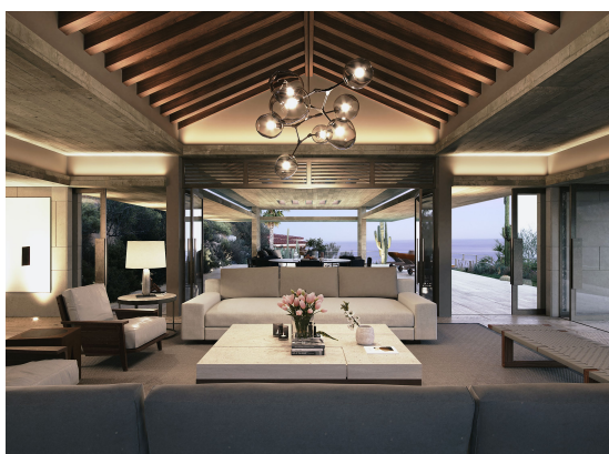
*The renders are a construction proposal; this construction is not included in the sales price.